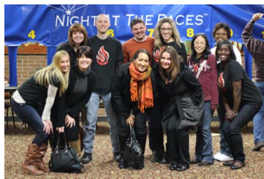
Torchbearers Akron volunteers having a great time at Night at the Races