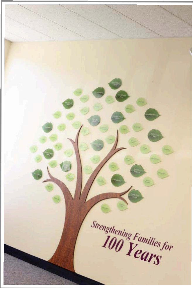
Greenleaf Family Center's 100 year anniversary Giving Tree continues to grow